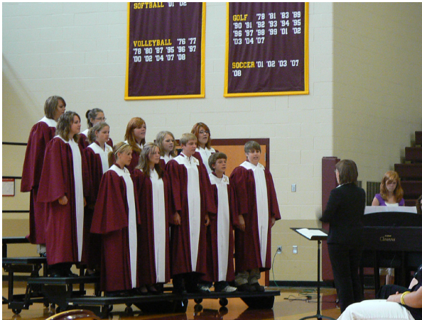
The KHS Chorale performed during the Dedication Ceremony.