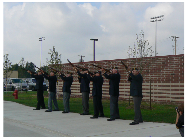
An Honor Salute!