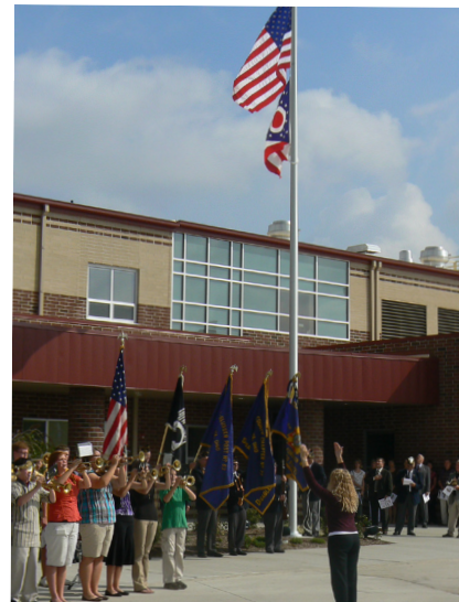
The KHS Band played the Star Spangled Banner.